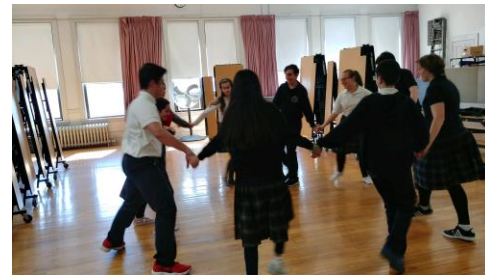
Grade 8 learning a dance in music class.