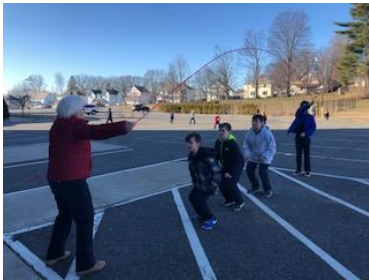
Boys jumping rope and having fun during Extended Care.